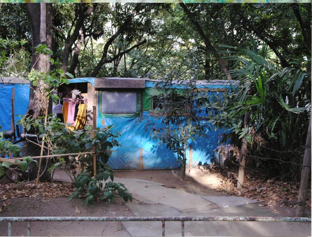
Shinjuku, Tokyo, Japan