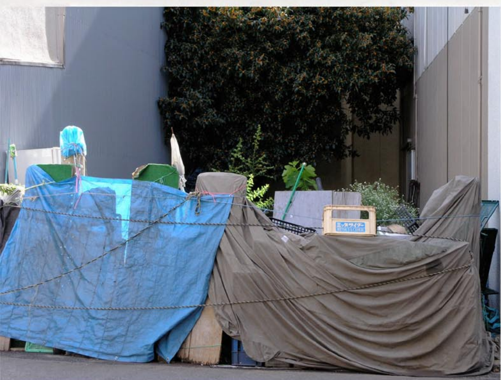
Jizo-zaka street, Mukojima, Sumida-ku, Tokyo