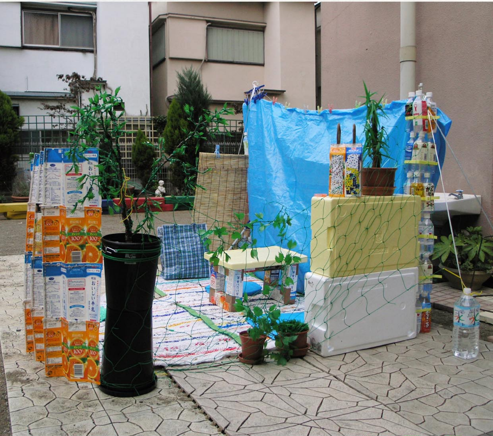
Excellent Sumida 602 1-5-9 Tsutsumi-dori Sumida-ku Tokyo